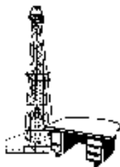
ASSOCIATION OF DESK AND DERRICK CLUBS

Leave us with a quote or a bit of advice: "Be stubborn about your goals, but flexible about your methods."